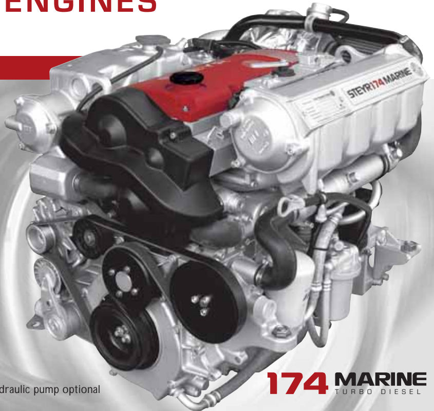
Hydraulic pump optional

The state-of-the-art STEYR Marine Diesel Engine with dual cooling circuit fulfilling the strengthened future marine emission regulation.