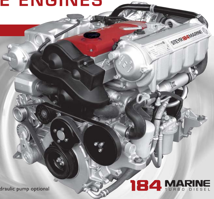
Hydraulic pump optional

The state-of-the-art STEYR Marine Diesel Engine with dual cooling circuit fulfilling the strengthened future marine emission regulation.